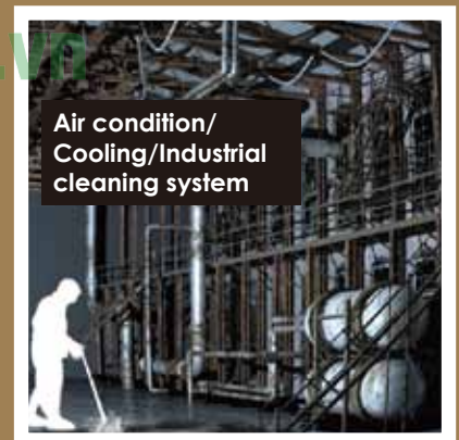
Air condition/ Cooling/Industrial cleaning system