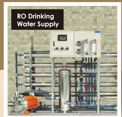
RO Drinking Water Supply